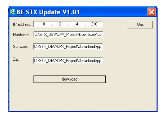
Figure 3. STXLP AutoUpdate Program

6. Once the AutoUpdate application has launched, enter the STXLP Transmitter I.P. Address.